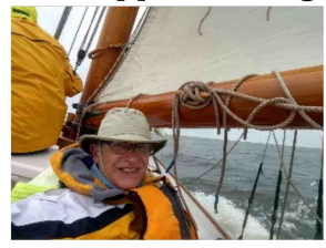
3 The author as we motored into St. Michaels harbor