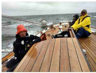
2 Elf crew under engine power